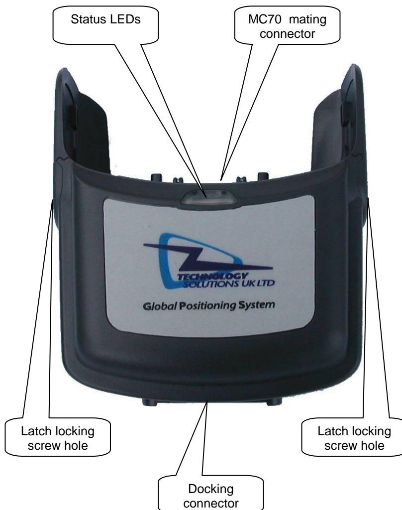
Figure 1: The parts of the GPS 1058

Technology Solutions (UK) Limited reserves the right to change its products, specifications and services at any time without notice. Technology Solutions (UK) Limited provides customer assistance in various technical areas, but does not have full access to data concerning the uses and applications of any customer's products. Therefore, Technology Solutions (UK) Limited assumes no responsibility for customer product design or for infringement of patents and/or the rights of third parties, which may result from assistance provided by Technology Solutions (UK) Limited. No part of this document may be reproduced in any form without the written consent of the author.