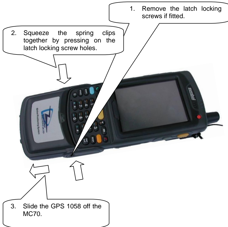
Figure 3: Detaching from an MC70

Technology Solutions (UK) Limited reserves the right to change its products, specifications and services at any time without notice. Technology Solutions (UK) Limited provides customer assistance in various technical areas, but does not have full access to data concerning the uses and applications of any customer's products. Therefore, Technology Solutions (UK) Limited assumes no responsibility for customer product design or for infringement of patents and/or the rights of third parties, which may result from assistance provided by Technology Solutions (UK) Limited. No part of this document may be reproduced in any form without the written consent of the author.